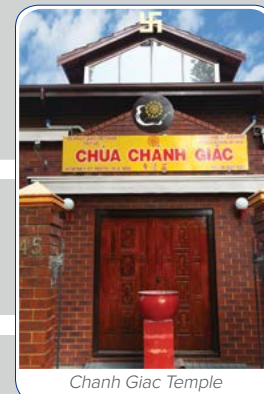
Chanh Giac Temple