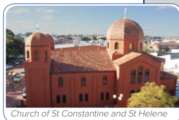
Church of St Constantine and St Helene

The temple is a focus for Perth's Vietnamese community, which expanded after the end of the Vietnam War in 1975. It was erected by the Vietnamese Buddhist Association of WA in 1990.