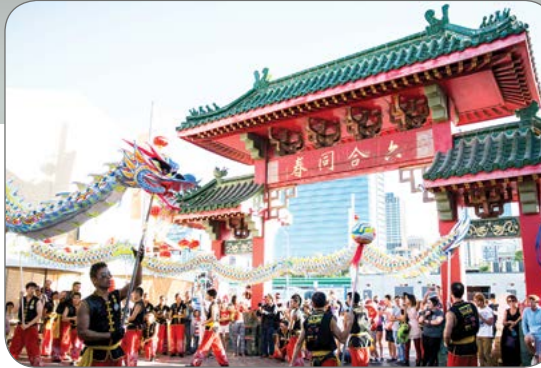
Chinatown is Perth's exuberant centre for Asian culture

Department of Local Government, Sport and Cultural Industries Office of Multicultural Interests