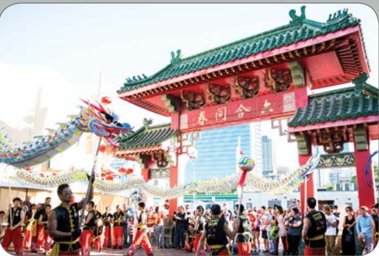
Chinatown is Perth's exuberant centre for Asian culture

Explore the suggested trails on this map to discover some of Perth's abundant and diverse heritage.